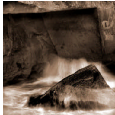
Figure 2: Alka Krisson