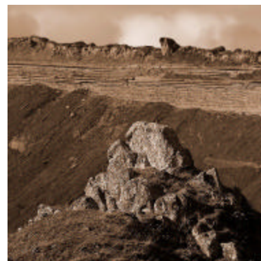
Figure 3: Brent Glover