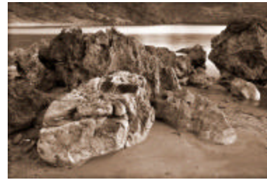
Figure 1: Chris Morton

Eventually we settled on a rock landscape theme and only concentrated on the Bowron digital competition.