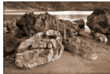
Figure 1: Chris Morton

Eventually we settled on a rock landscape theme and only concentrated on the Bowron digital competition.