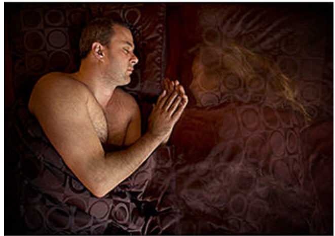
Silver medal, Iris Professional Photography Awards 2008