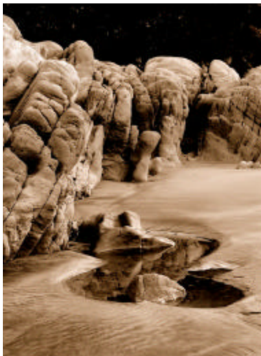
Figure 4: Robert Jaques

Additionally, all participants registered for the NRC may submit up to 2 prints for exhibition and judging.