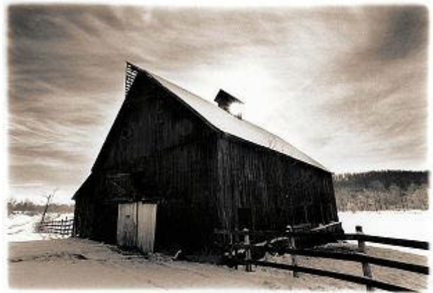
"Derelict Barn" - Anonymous

We're looking forward to getting to know you a little and trust you will enjoy your time with us.