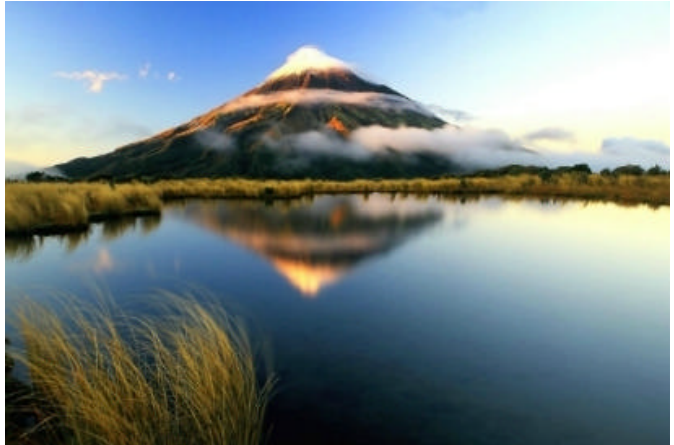
Morning Taranaki

We waited at the little tarn on the side of the track for the sun to rise and were blessed with spectacular light and wonderful views. We shot away to our hearts content before heading off on our tramp feeling very pleased with ourselves. As we tramped along the mountain came in and out of view giving us some chances for some good moody shots.