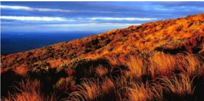
Evening Tussock

We rose in the dark at 5:30am and were very disappointed to find the hut again surrounded by mist. Oh well, we had a long tramp so we decided to get going anyway and left the hut in very pale light at 6:30am. And so pleased we did too, as we walked over the hill there was the Volcano dimly lit but virtually clear of cloud.