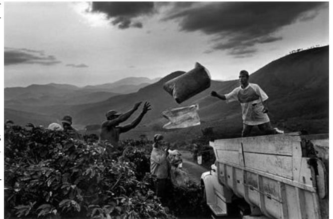
Coffee Pickers