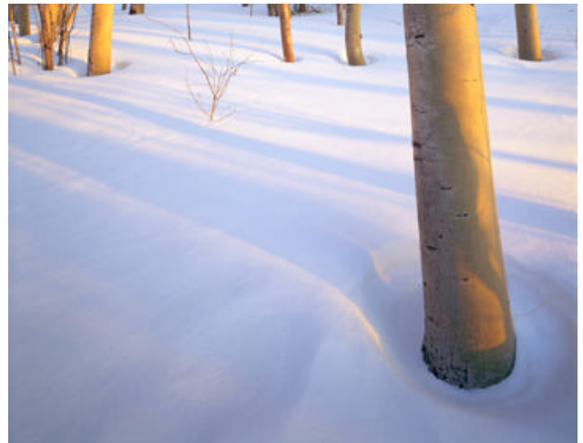
"Last Light, Winter Aspens"

"Make your photographs when you are touched unbearably and cannot restrain yourself, when it is something you must do. Consider the finished print to be a bonus. And if you follow your heart, whether your photographs are successful or not, you will at least have had the pleasure of the experience of their making. That is no small thing"