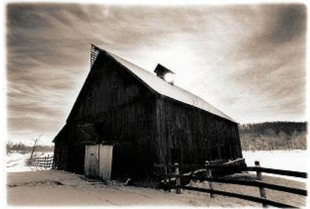
"Derelict Barn" - Anonymous

We're looking forward to getting to know you a little and trust you will enjoy your time with us.