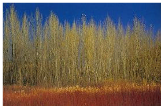
Shot with 35mm SLR on Fuji Velvia.

Lastly Projection. For me nothing beats the visual impact of a projected slide.